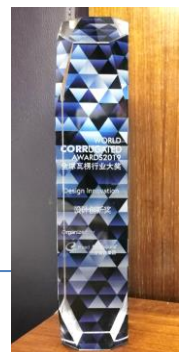
2019 World Corrugated Award First Prize