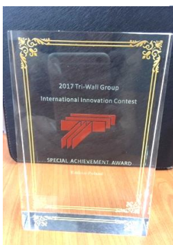
2017 Tri-Wall Innovation Contest Special Achievement Award

We made Progress – from Special Achievement Award in 2017 to the winner; We made History – first prize in World Corrugated Award; We made a Difference in the Corrugated Packaging Industry!