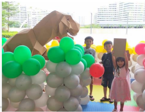
Mendaki Playfest @Punggol Town Square

Preschool Market all set for Eco Kampung Carnival 2019 at Gardens by the Bay, Bayfront Pavilion! They will be running various workshops and learning trials for preschoolers, as well as launching Start Small Dream Big 2019 opening by Minister Desmond Lee on 26 th April. For more information kindly visit: