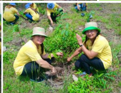
For our planet