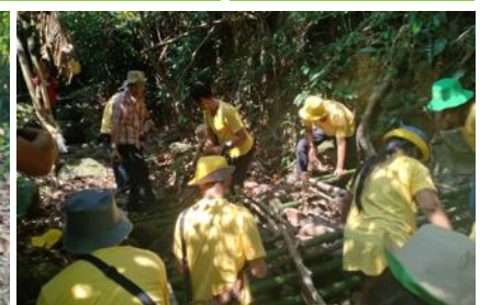
Dam building and repairing to control water speed in the upcoming rain season