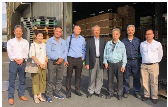
Picture with Multipack team