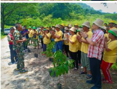
Introduction by the ranger