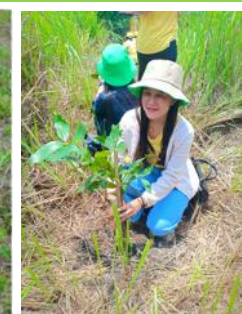
For our future