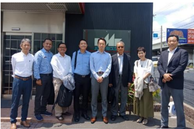
Picture with Pack Mizutani team